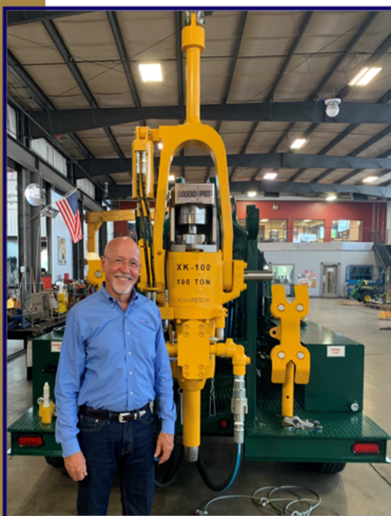
XK-100 with Hi-Pressure Head